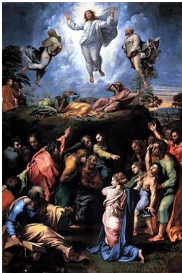
The Transfiguration by Raphael , c. 1520